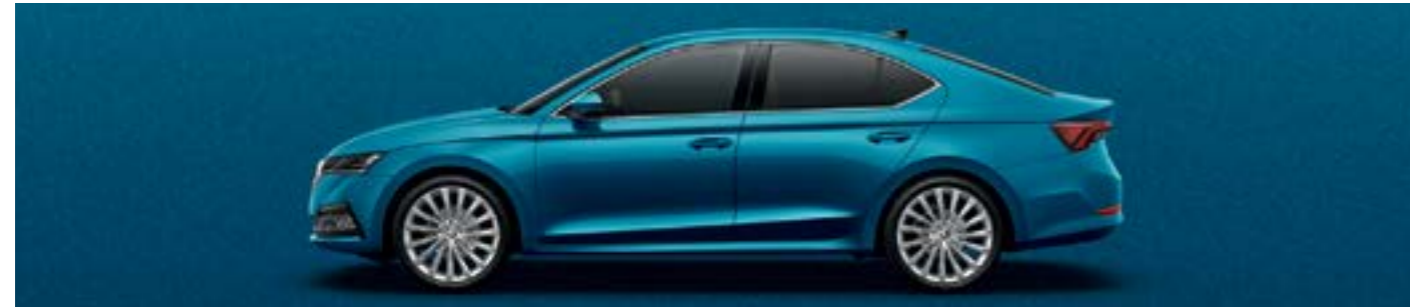
LAVA BLUE METALLIC