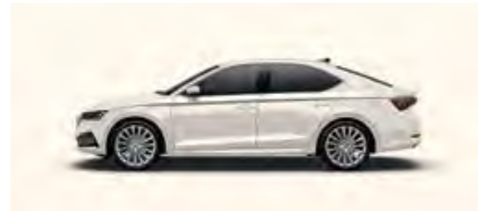
CANDY WHITE UNI