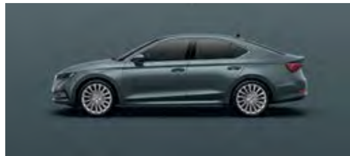
QUARTZ GREY METALLIC