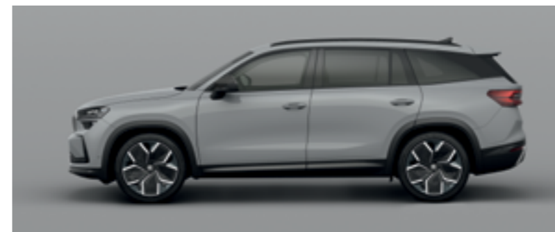
Steel Grey uni *