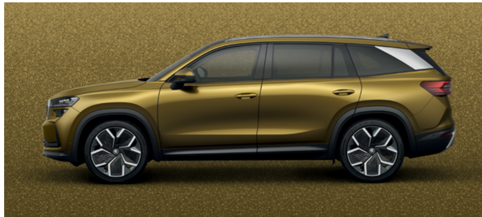
Bronx Gold metallic