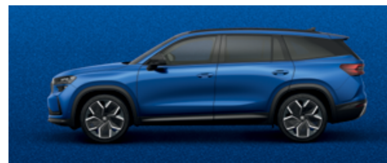
Race Blue metallic *