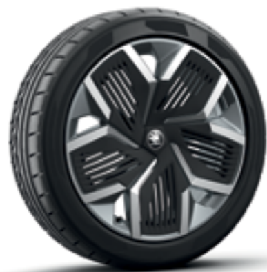
20" Rila Aero anthracite alloy wheels with black Aero covers