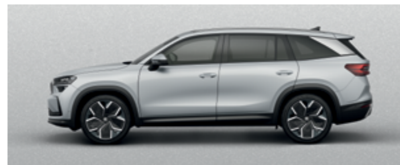
Brilliant Silver metallic