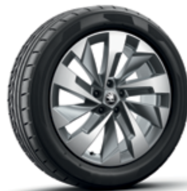
19" Halti Aero anthracite alloy wheels