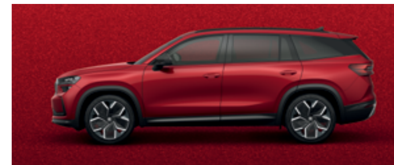
Velvet Red metallic *