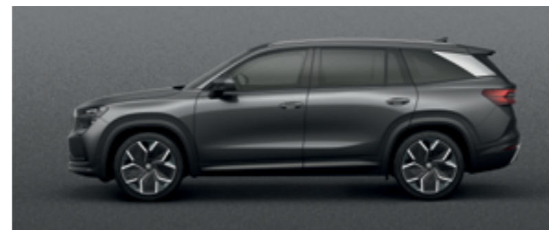
Graphite Grey metallic