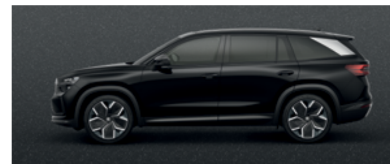
Magic Black metallic